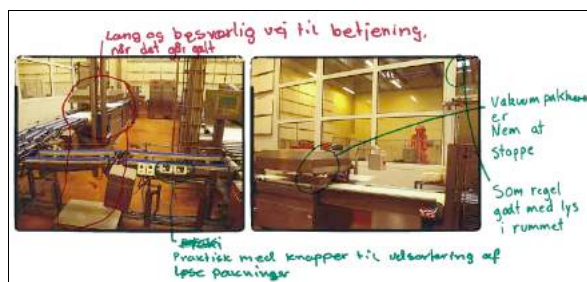
Figure 4 – Comments on one of the workbook’s page identifying positive and negative aspects

With the guidelines, the comments were combined (in certain cases) in order to become more general and easier to apply for the new project. However, the pictures of the current situations were kept to maintain the visual reference. The comment quoted above, for example, turned into the following guideline: “ it is important to make sure that all the main operations within the production line can be done without the need to go all the way around to the ‘other side’ of the line, making it a long way for the workers when they need to reach it fast ”. Besides that, as already mentioned, both the comments and the guidelines were divided into five categories. The goal was to organize them from the broader to the more specific ones, trying to follow the designers’ “logics”, e.g. what the designers would need to know first.