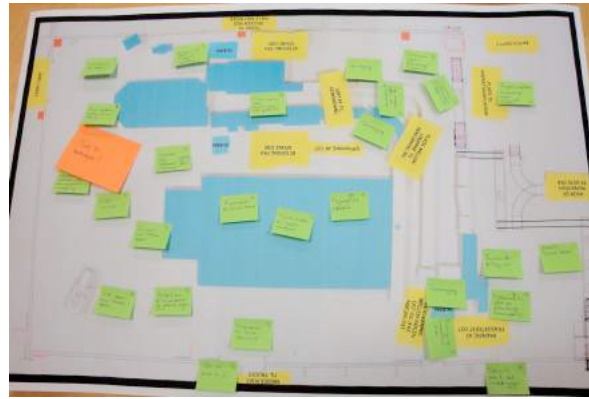
Figure 5 – One of the layout options with the post-it notes identifying positive and negative aspects

At a second stage, the main results were the layout options proposed by the workers. Not only the drawings themselves, but also the comments made identifying the positive and negative aspects of each layout option based on the previous observations and workbooks’ comments (Figure 5).