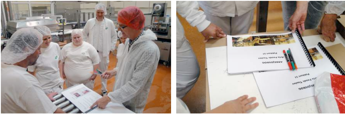
Figure 2 – The workbook

Three workbooks were made in total: one for each of the three production lines studied. After the ten days, the researchers collected back the workbooks and an analysis was made on the comments. It was decided to classify the comments into five main categories: layout, ambiances (lighting, acoustics, thermal comfort), production line (fixed equipment), auxiliary/mobile equipment and work organization. And from the “categorized comments”, design guidelines were written, following the same “categories”, in order to facilitate the communication with the designers. Each guideline was based on the workbooks comments, but (re)written in order to lead to possible solutions for the new project.